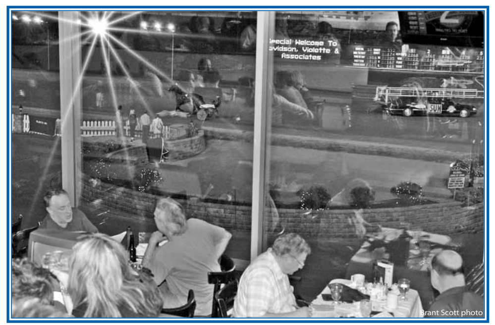
NIGHT AT THE RACES DRAWS BIG CROWD: The Perley Rideau Foundation's 11th annual Night at the Races on May 4 attracted 440 guests for a night of food and fun at the Rideau Carleton Raceway on Albion Road. The event netted $34,000 for the Capital Campaign: Building Choices, Enriching Lives.

"We couldn't have done it without the generosity of our sponsors and the people who