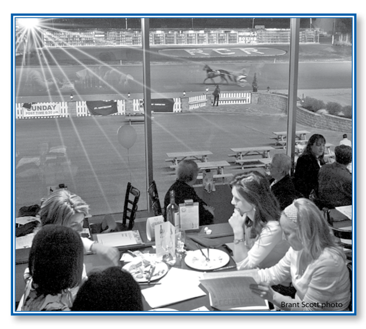
ELEVEN TIMES LUCKY: The 11<sup>th</sup> annual Night at the Races will kick off on Friday, May 4 at the Rideau Carleton Raceway. Get your tickets now to avoid disappointment.

This popular event held at the Rideau Carleton Raceway has raised more than $250,000 for the Foundation since its inception in 2002. The 425 tickets sell out every year and the Foundation hopes to secure even more tables for May 4. Rideau Carleton Raceway features standardbred harness horse racing at 4837 Albion Road in Ottawa.