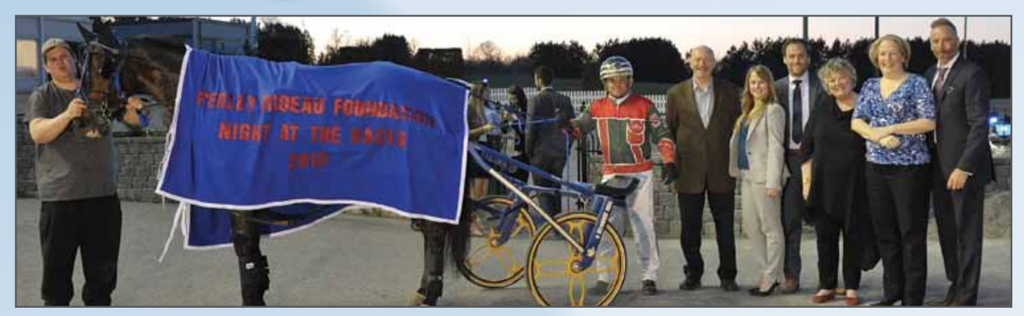
After winning the 6th Race, Holiday Party proudly wears the Perley Rideau Foundation cooler while the horse's owners, trainers and driver look on happily.