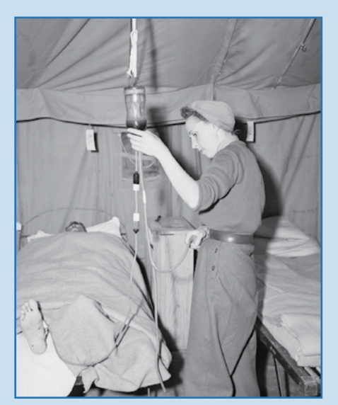
Nursing Sister administers blood transfusion in a field hospital during the Second World War.

the war: blood transfusions and penicillin. The success of both treatments depended on meticulous administration and monitoring. As evidence mounted that injured soldiers cared for by Nursing Sisters fared better than those cared