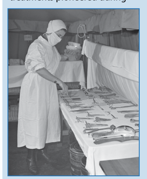
Nursing Sister prepares surgical instruments.

Nursing Sisters played a central role in two innovative treatments pioneered during