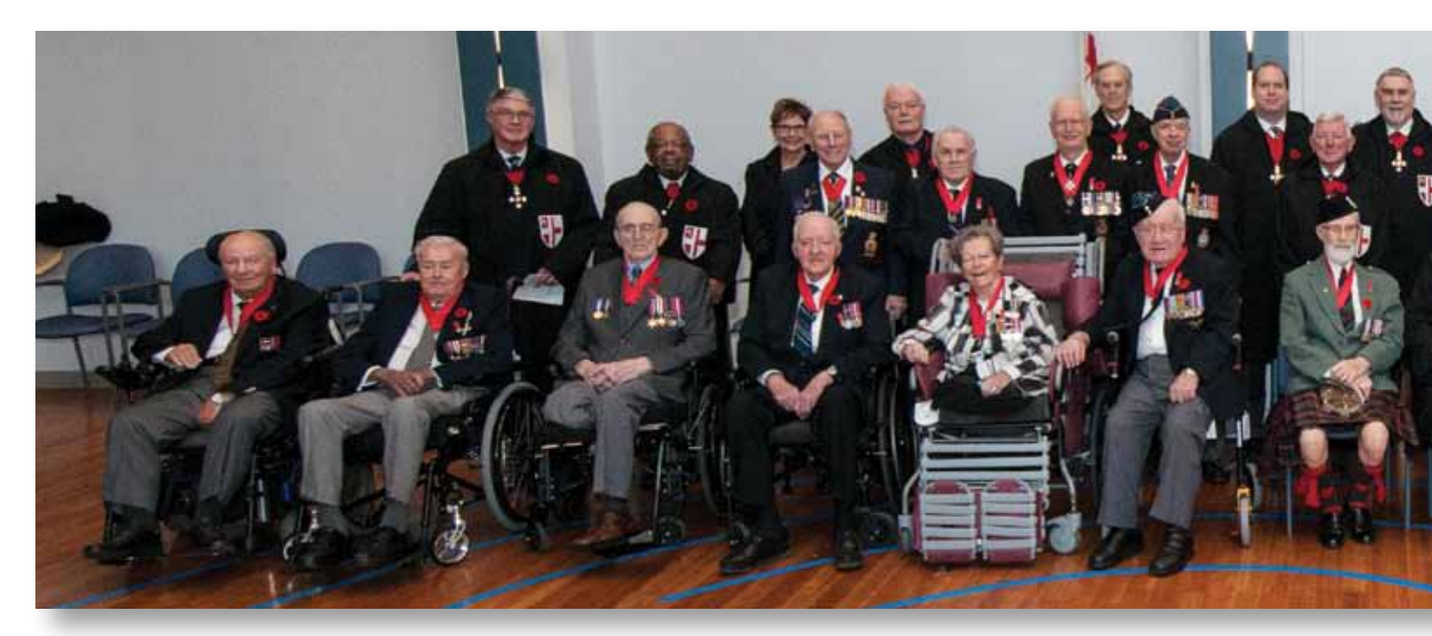
ORDER OF ST. GEORGE INVESTITURE FOR 2013: Several Perley Rideau veterans who were placed in "harm's way" in serving celebrating its 10<sup>th</sup> anniversary and is pleased to recognize the efforts of Perley Rideau veterans and induct them as new members.