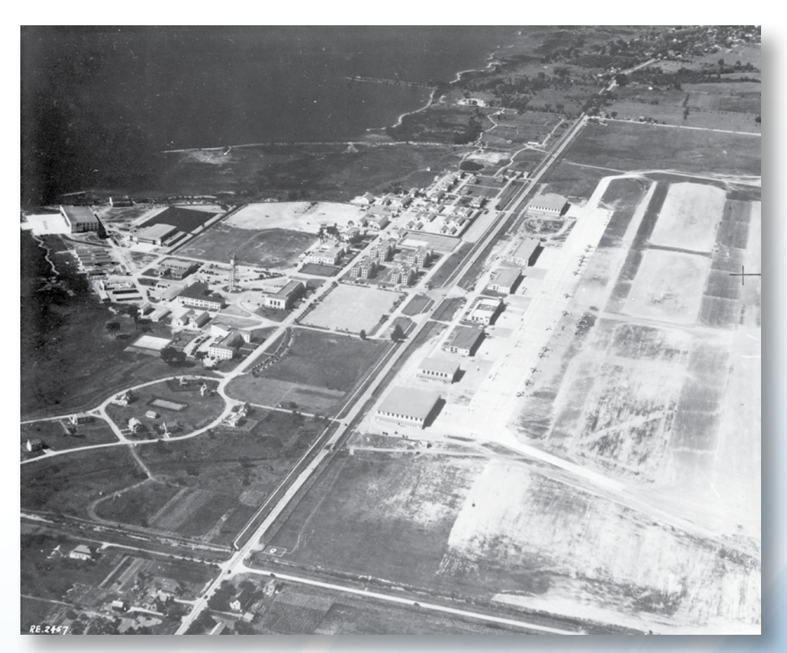
Aerial view of CFB Trenton during Second World War.

by the Royal Canadian Air Force and known today as Canadian Forces Base Trenton. After Nazi Germany invaded Poland in 1939, the Allies recognized that gaining control of the skies would be essential to victory. To achieve this goal, however, would require quickly training and deploying hundreds of thousands of pilots, navigators and support staff. In December 1939, the British Commonwealth Air Training Plan came into being and CFB Trenton soon became the world's largest aviationtraining centre.