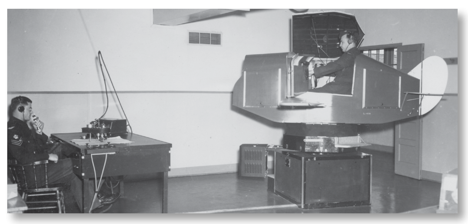
Pilot trains on simulator during Second World War. Commonwealth Air Training Plan Museum Courtesy: Commonwealth Air Training Plan Museum