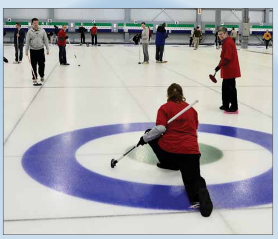
National Defence Directorate General Aerospace Equipment Program Management Bonspiel in support of the Perley Rideau