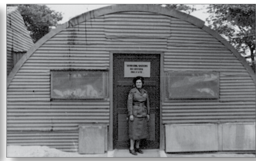
Nurses quarters, 25 FDS Korea, 1953

"I really enjoyed meeting nurses on bases across the