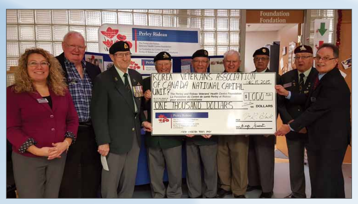
The Korean War Veterans Association presented a $1,000 cheque to the Perley Rideau Foundation.