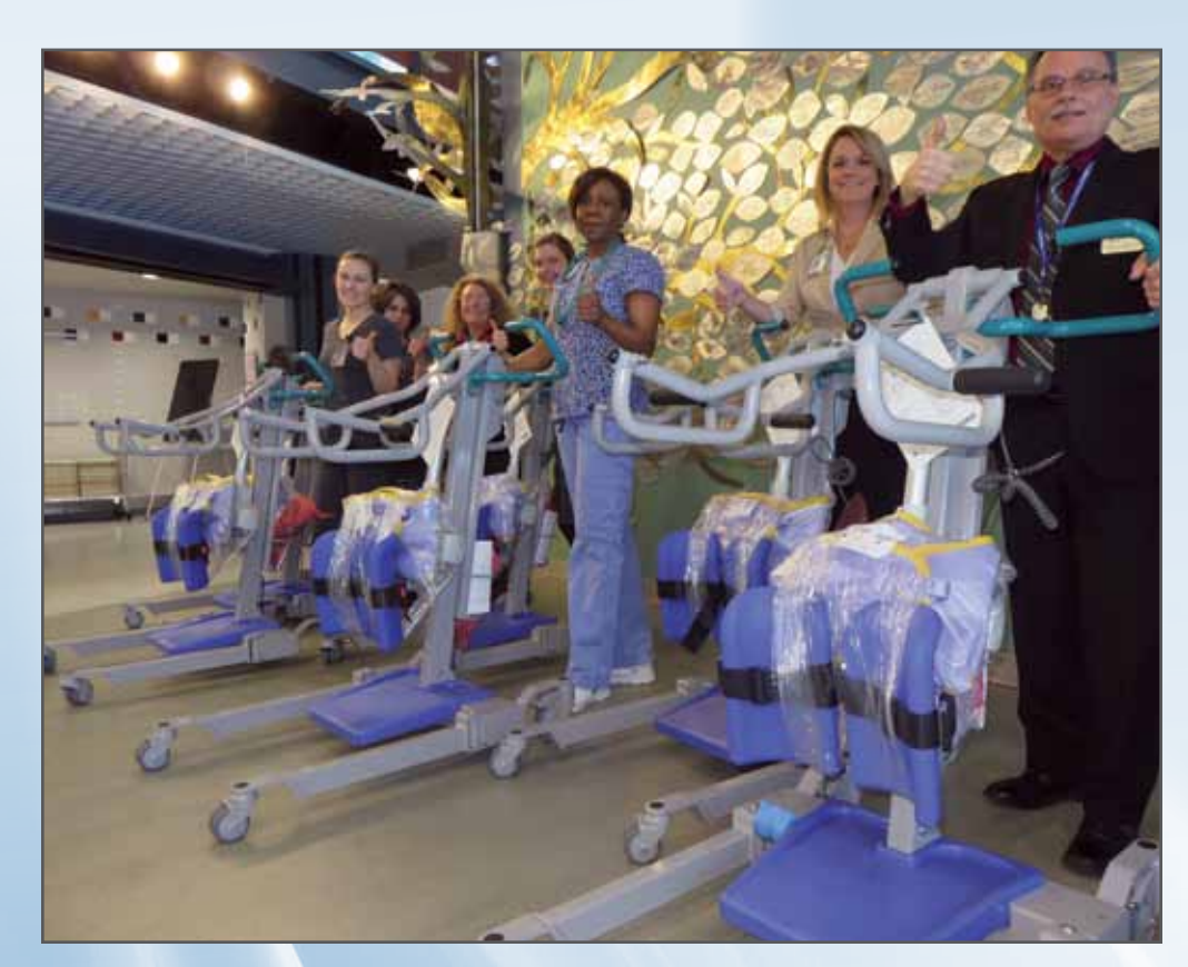
Thanks to the generous support of the Audette Foundation and other donors, the Perley Rideau Foundation bought 10 new lifts. The lifts are essential equipment used continuously throughout the day to make everyday activities much easier.