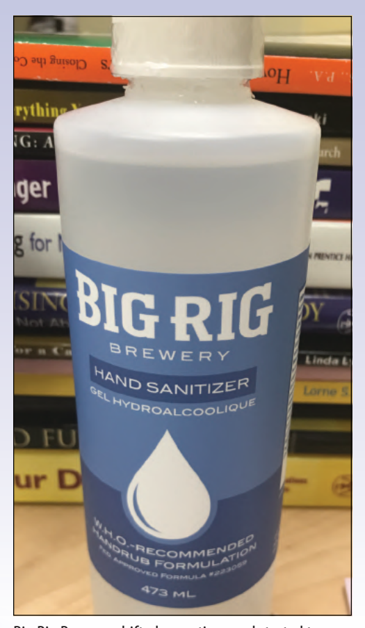
Big Rig Brewery shifted operations and started to produce hand sanitizer, and generously donated 75 bottles to the Perley Rideau.