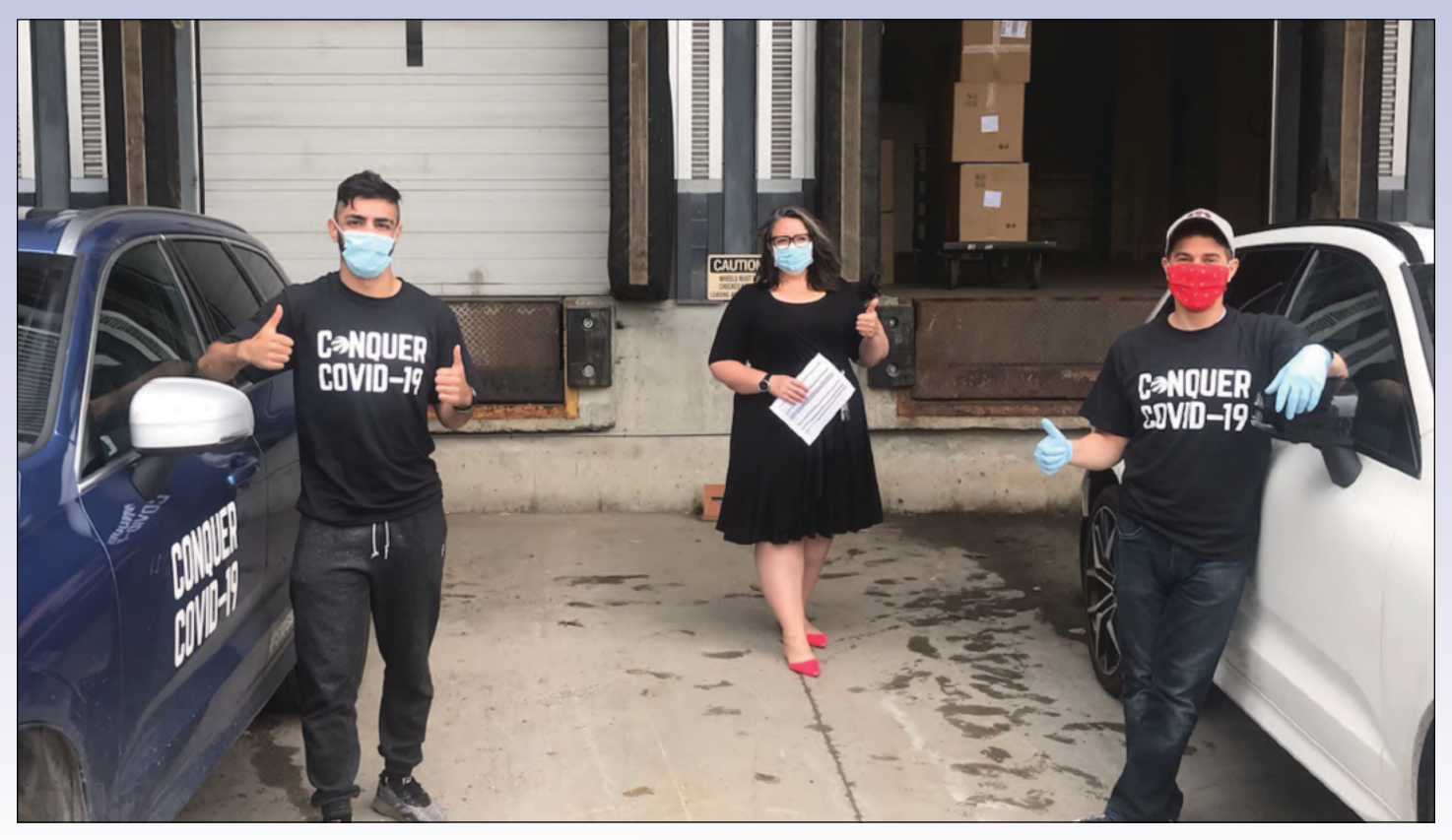
Thank you to Conquer COVID-19, a local group of physicians, business leaders, entrepreneurs and other volunteers, for the donation of 17 boxes of PPE (personal protective equipment) and hand sanitizer.